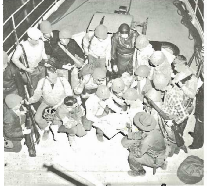
CADETS PREPARING FOR THEIR LANDING...